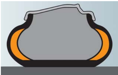
RUNFLAT Tyre Technology