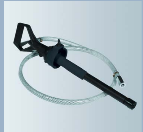
593 12 77 TT SEAL XXL hand pump