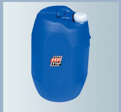
593 12 60 TT SEAL XXL 60 l PE-barrel