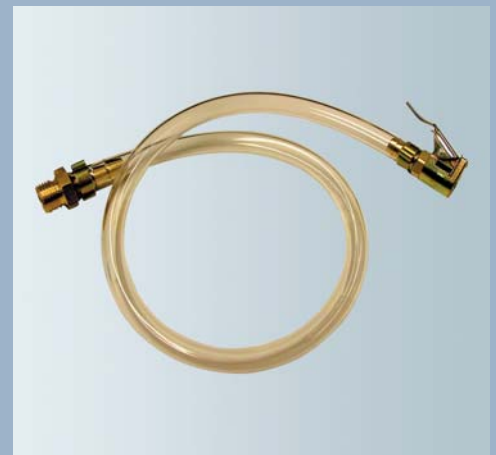
593 12 84 Valve adapter, from hand pump hose to valve