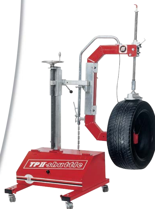
517 49 00 TP II SHUTTLE