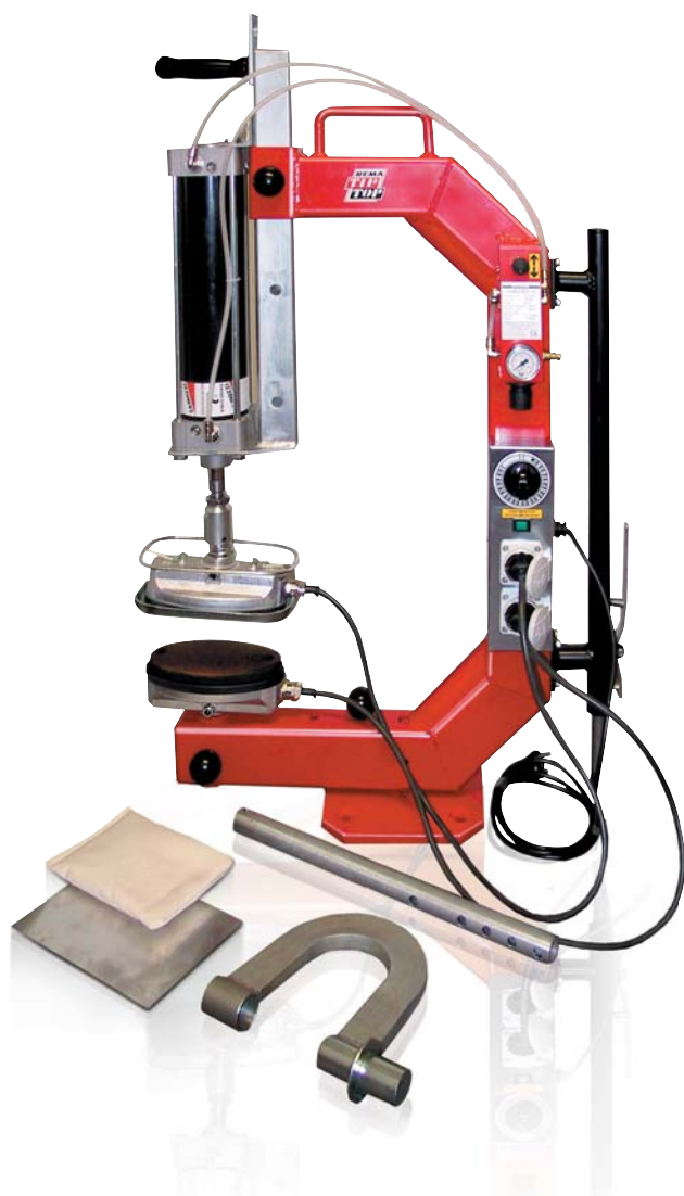
517 35 31 TP II PNEUMATIC (230 V)

The classic vulcanizing machine for the repair of all types of tyres, and injuries to the tread, shoulder and sidewall. Available in various versions: ECONOMY (mechanical) and PNEUMATIC (pneumatic). Digital temperature control as option.