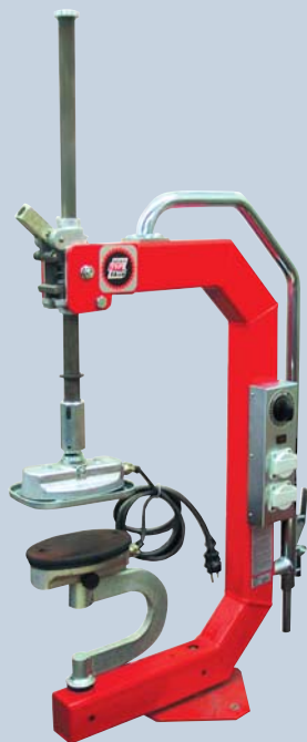
517 15 25 TP II ECONOMY (230 V)